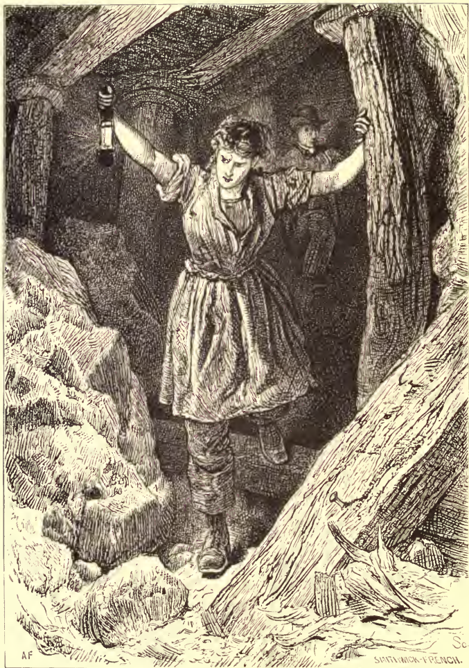
She stepped into the gallery before he could protest.—See p. 296.